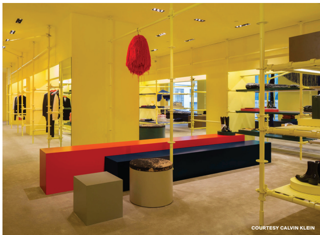
Calvin Klein 205W39NYC 654 Madison Avenue, New York

Tel: 212-292-9000 Designers: Raf Simons and Sterling Ruby