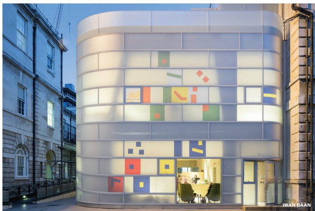
St Bartholomew's Hospital West Smithfield, London EC1A 7BE

Tel: +44-0300-123-1801 Architect: Steven Holl Architects