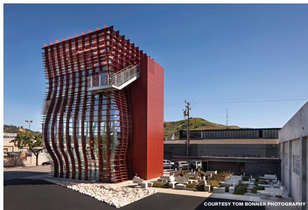
Vespertine 3599 Hayden Avenue Culver City, California

Tel: 323-320-4023 Architect: Eric Owen Moss Architects